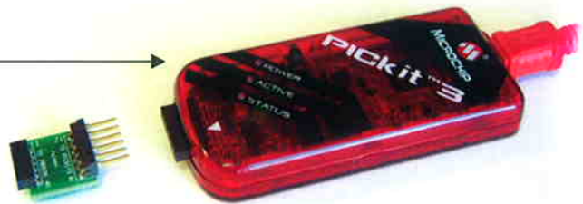
Figure 1 PICKit3 and Adapter Board