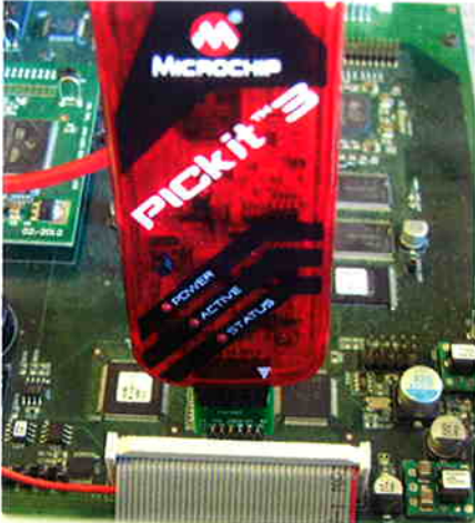
Figure 3 PICkit3 Assembly Plugged into J11 Location on the Main Circuit Board