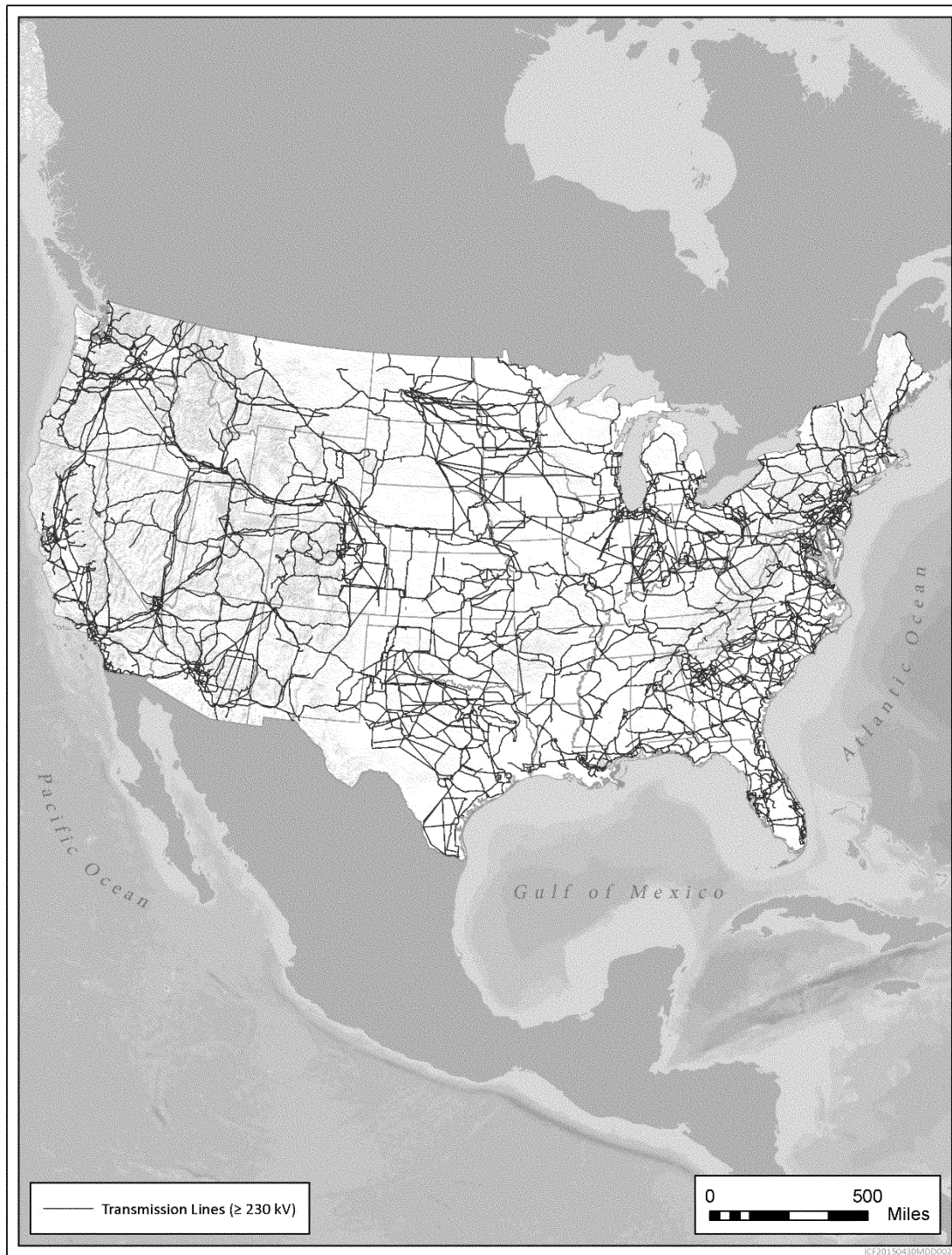
Figure 2 - Electrical Transmission Lines across the Continental United States 378