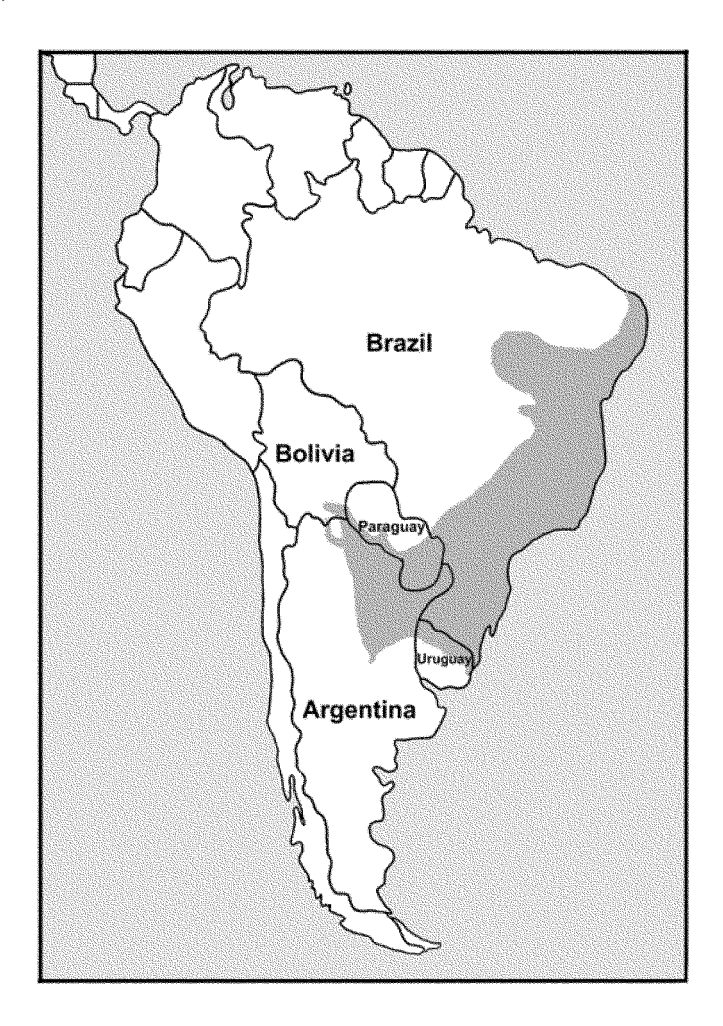
Figure 1. Distribution of broad-snouted caiman. Courtesy of Piña et al. 2009.

The map below illustrates the distribution of the species. Below is the best available information regarding the status of the species in each country.