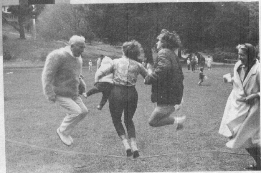
"ONE - TWO - THREE"