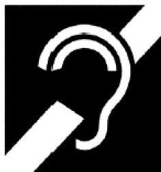
Figure 703.7.2.4 – International Symbol of Access for Hearing Loss