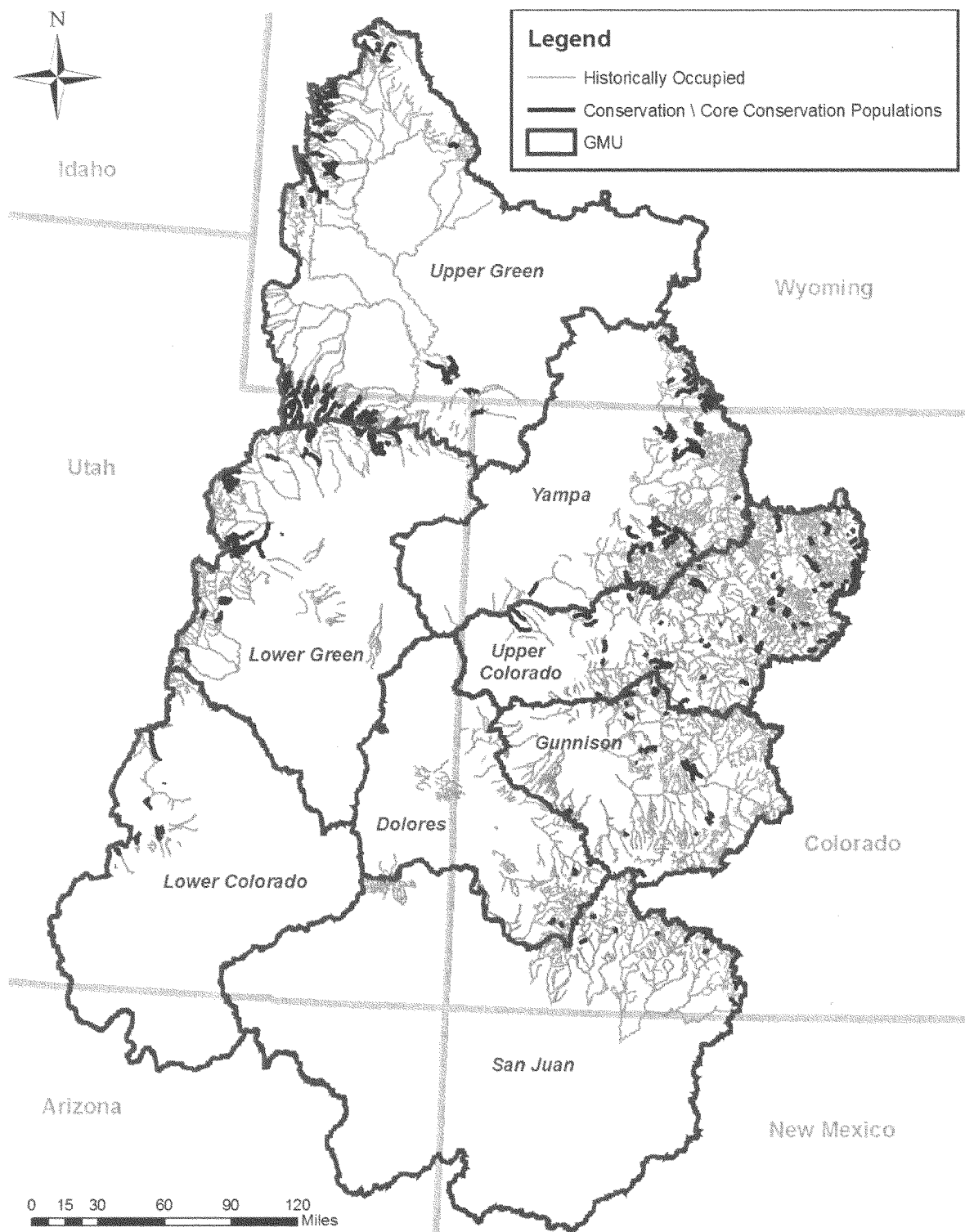
Figure 2. CRCT Conservation Populations